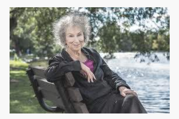
Award winning author, Margaret Atwood

THE TORONTO WILDLIFE CENTRE'S WILD BALL is an evening held in support of the work we do to support the rescue, medical care and rehabilitation of sick, injured and orphaned wild animals.